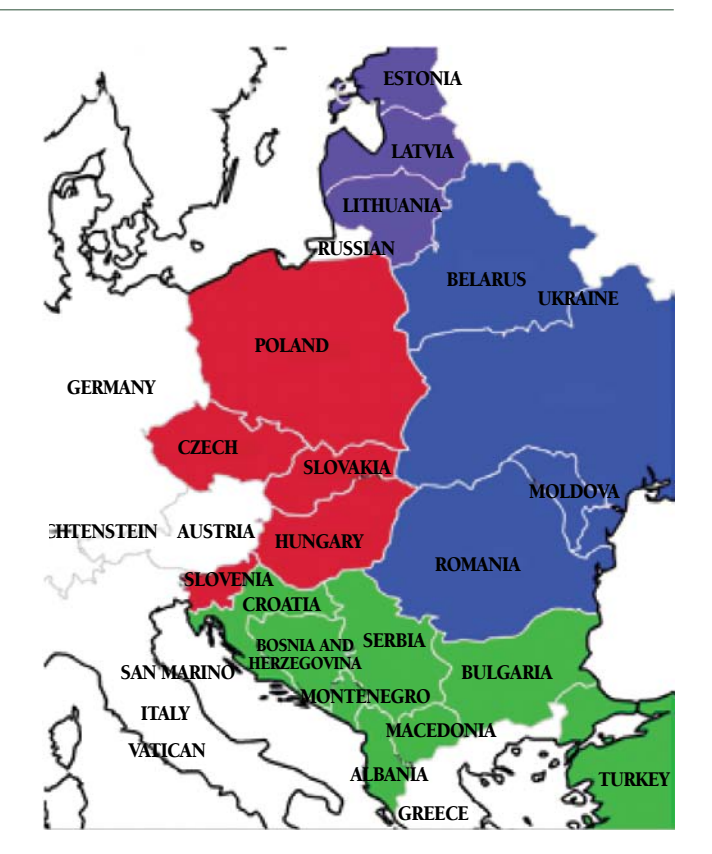
Figure 1 Eastern Europe as subdivided into Northern (purple), Eastern (blue), Southern (green) and Western (red) regions, for the purposes of this review.

Specific country name included all 19 countries included in study separated by Boolean operator 'OR'. As Google Scholar has no keyword search, a title search was performed.